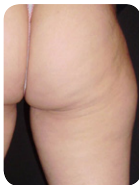
After 12 treatments